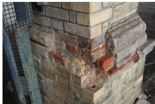
Much of the "Victorian" stonework is replacement concrete.

We support the majority of the proposals that will transform this site into a sustainable visitor experience. Whilst the Victorian legacy is being well represented, the physical remains of its main claim to fame, the birthplace of broadcast television on the building's exterior elevation, is in danger of being lost. The photo below shows what was there at the inception of the BBC here in 1936 and should form the template for what is to be preserved. Notice the Higgs and Hill sign in the centre of the photo - they were master builders for over 100 years having built the Tate Britain, the BBC Television Centre and repairs to Windsor Castle. Their workmanship on the colonnade infills is of a high standard and defines the dynamism that was happening inside.