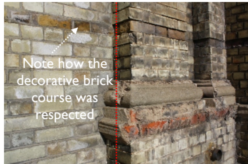
Note how the decorative brick course was respected